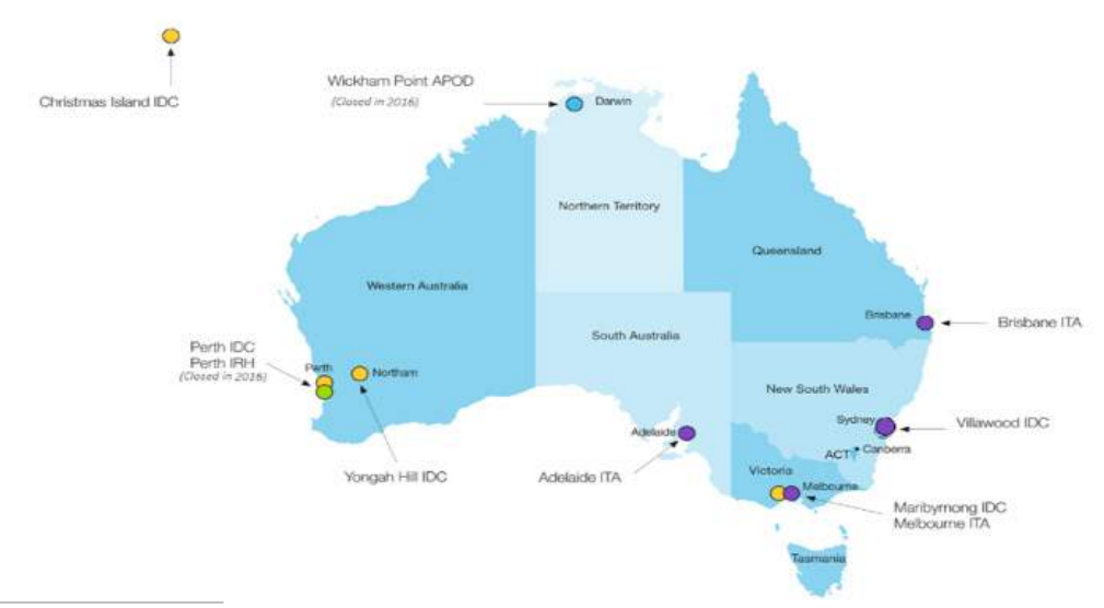
Figure 1: Map of Australia's immigration detention facilities (May 2017)

Access to North West Point IDC in Christmas Island is much more challenging. The flights to the island are limited and expensive. The cost of accommodation and food is quite high.